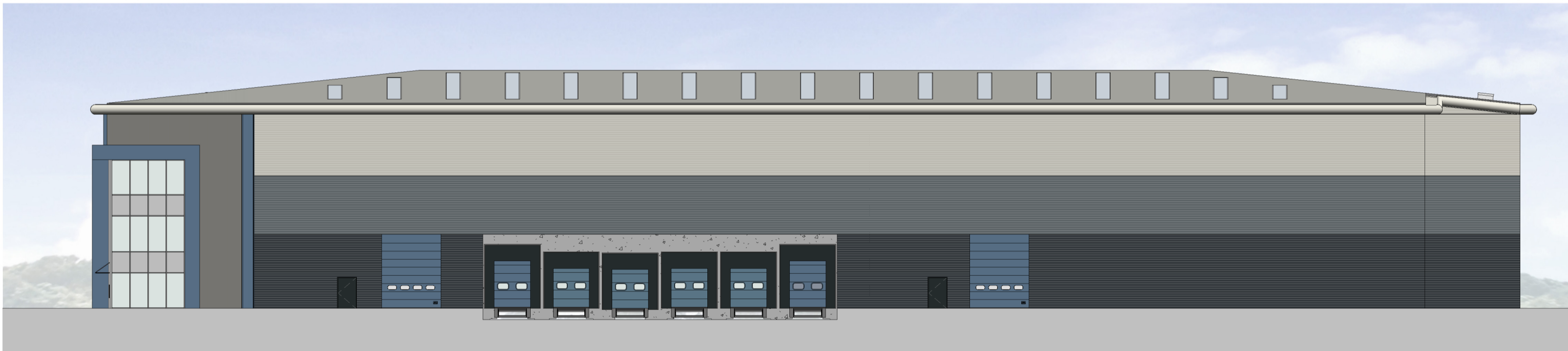
Unit 1 - Elevation C