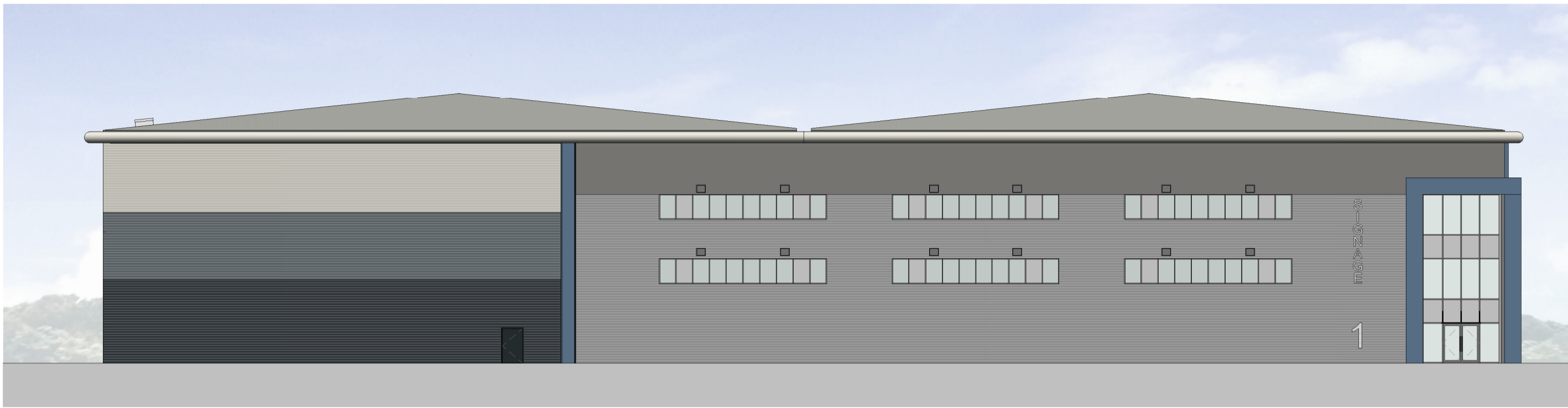
Unit 1 - Elevation A