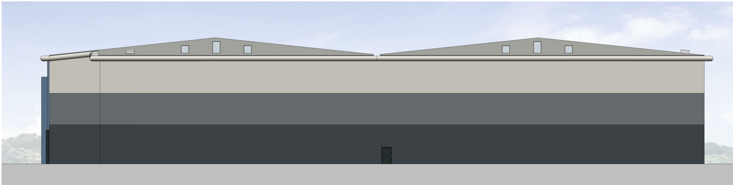
Unit 1 - Elevation B